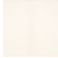
Creamy - 04 (CRY)